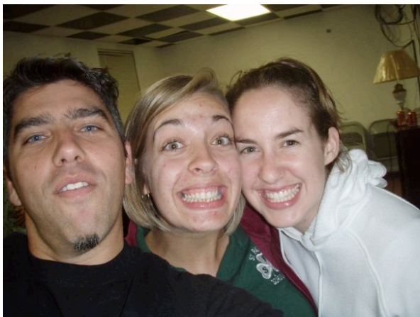
(Hopefully our crazy staff doesn't scare you away)